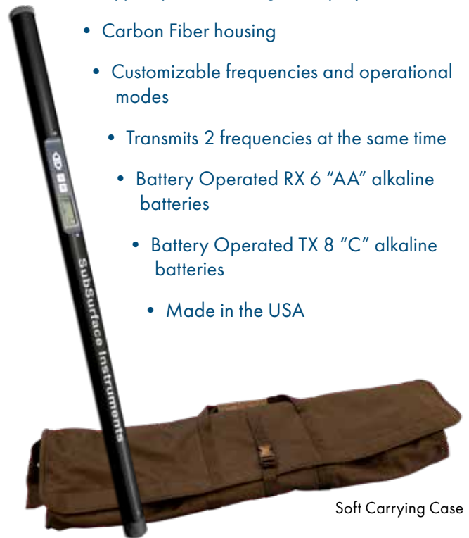
Soft Carrying Case